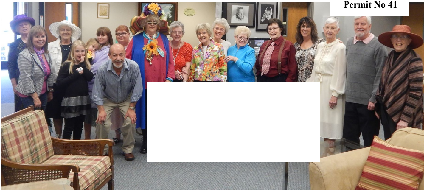
Victorian Tea Models, April 2019

Non-Profit U S Postage PAID Salem Oregon Permit No 41